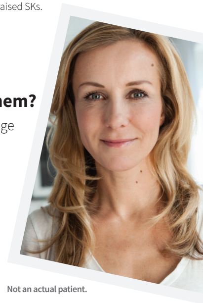
Not an actual patient.