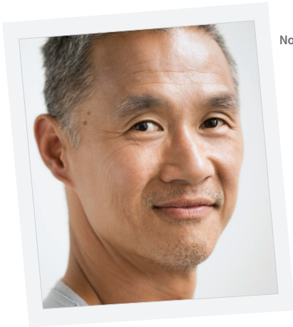
Not an actual patient.

Raised SKs can show up in your 40s — or even in your 30s